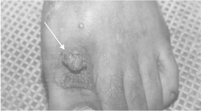
Fig. 4: Recalcitrant lesions on the dorsum of the foot.