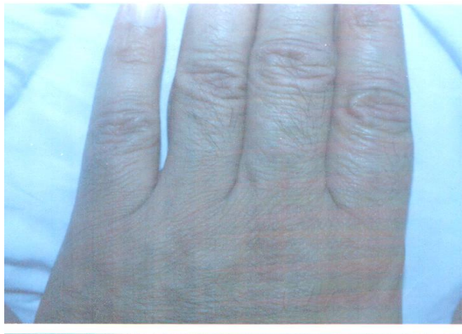
Fig 3 : The same area in Fig. 1, three months after CO 2 laser treatment. ``