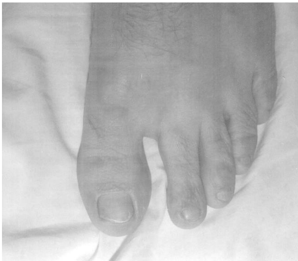
Fig. 6: The same area in fig. 4, but 3 months after the CO 2 laser treatment.