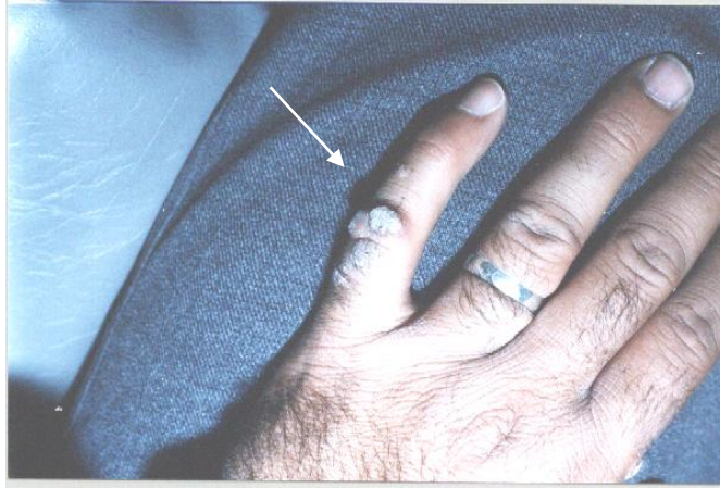
Fig. 1 Recalcitrant warts on the dorsum of the fingers