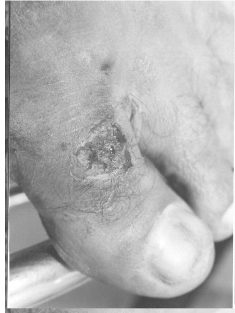
Fig. 5: The same area in Fig. 4, immediately postoperatively.