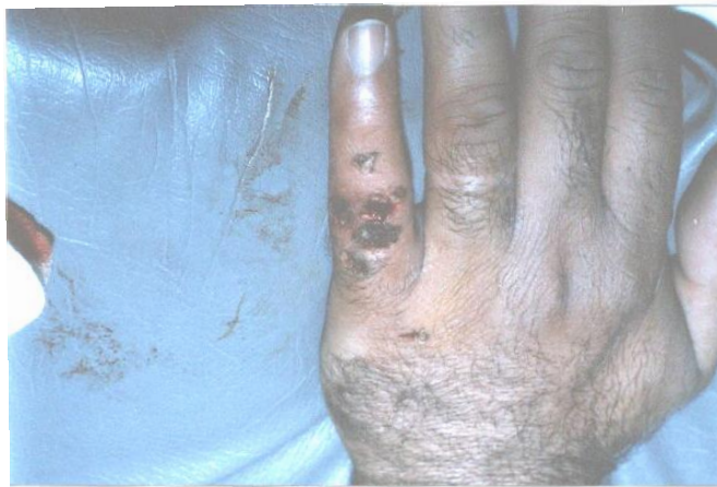
Fig 2 The same area in Fig. 1, immediately postoperatively