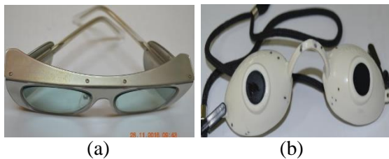
Fig.(2) goggles (a) for Nd:YAG laser operator (b) for patient

All patients were advised to avoid sun exposure of treated area two weeks following laser treatment in order to minimize the appearance of hyperpigmentation.