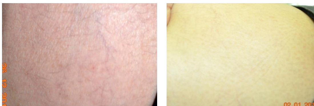
Fig. (4): spider veins of lower thigh (a) before (b) a week after laser treatment