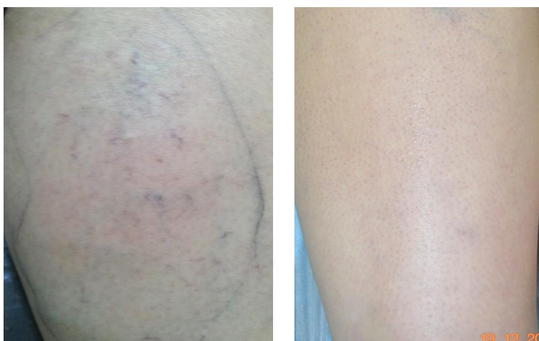
Fig. (3): spider veins of leg (a) before (b) 6 week after laser treatment